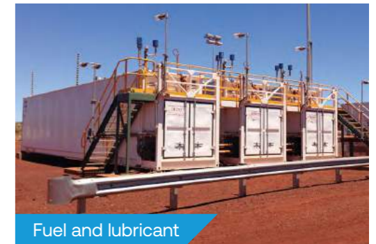
Fuel and lubricant