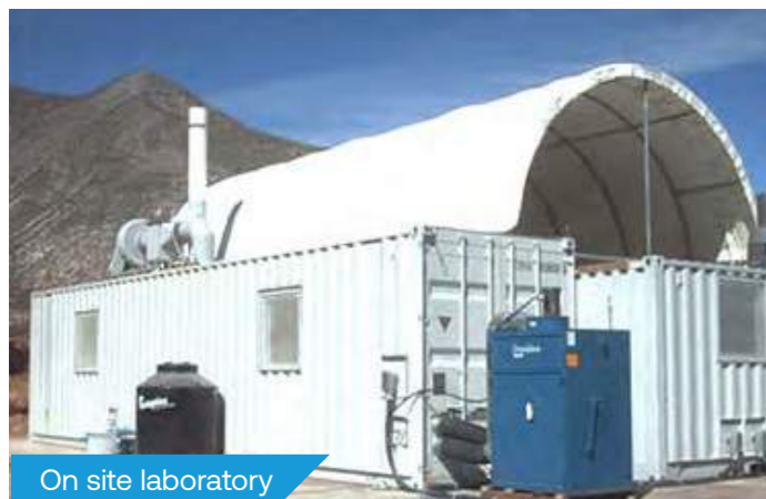
On site laboratory