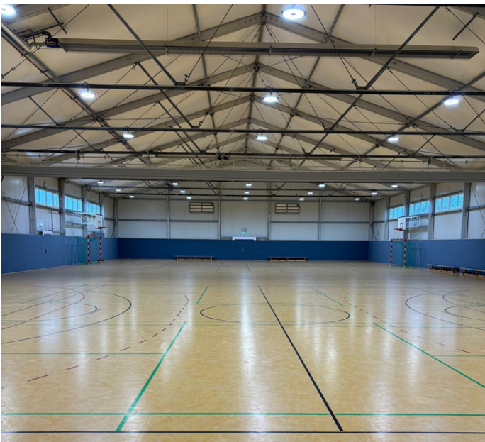
Multifunctional sports hall, Heilbronn, Germany.

Discover the future of sports facilities with modular construction. This method is efficient, flexible, and environmentally friendly, allowing us to build sport halls that are not only sustainable but also easily adjustable to new developments and changing needs. This ensures lasting, future-proof solutions for every club or community.