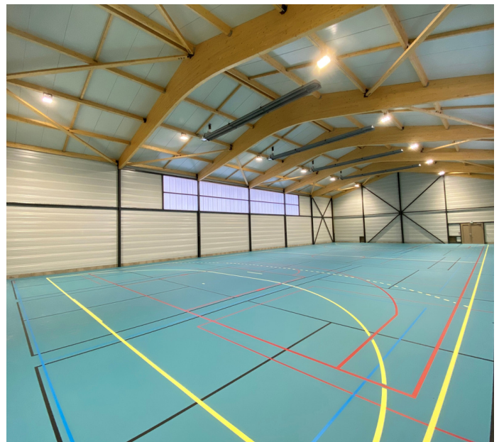
Multifunctional sports hall, Fimes, France.